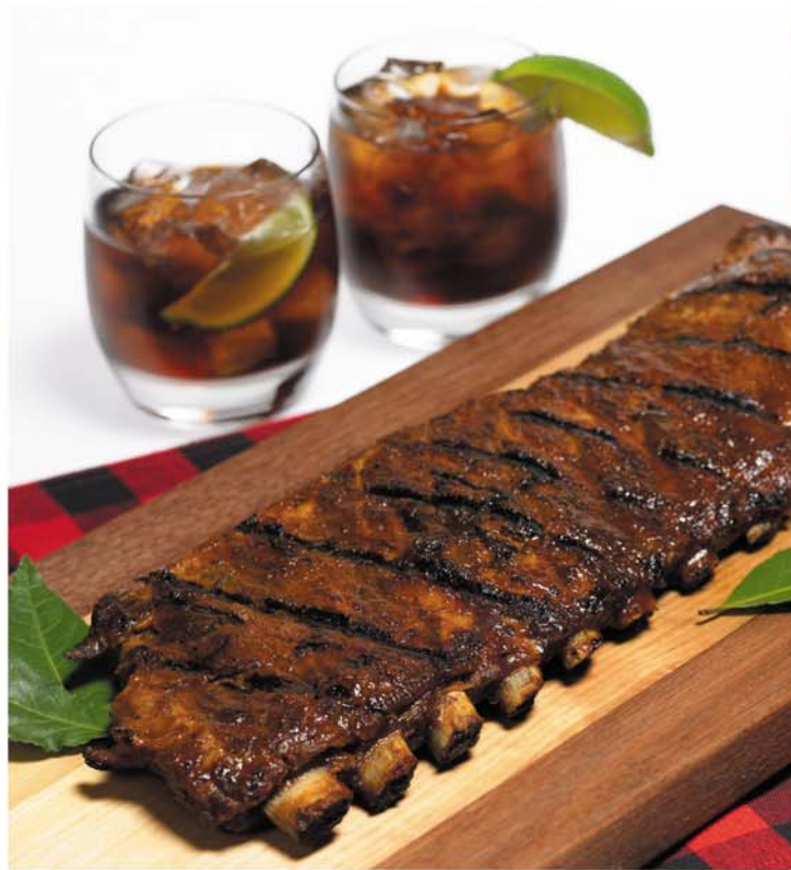
Cooking with Booze gives new meaning to being drunk with flavour, like these ribs marinated in rum and cola with a splash of lime.

PREPARATION: Season both sides of ribs liberally with salt and pepper. Place meat side down in 11-by-15-inch baking dish. Scatter onion and garlic evenly around ribs. Pour in cola. (It should cover ribs.) Cover dish with foil. Bake in preheated 200F oven 3 to 4 hours, until just tender. Remove from oven. Allow ribs to come to room tem-